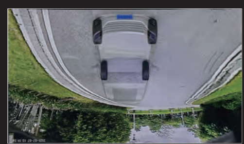
3D Perspective, Playback, Side View Technology

Specifications Sensor Chip G.C2053 FULL HD 1920X1080P 1280H X 720V Color 0.001LUX/F1.8 Automatic Day And Night Function Minimum Illumination Effective Pixels Video Output White Balance Backlight Compensation Strong Light Suppression Automatic PAL @25fps 210° 135° F1.6 IP67 Waterproof Level Relative Aperture Vertical Wide Angle Horizontal Wide Angle