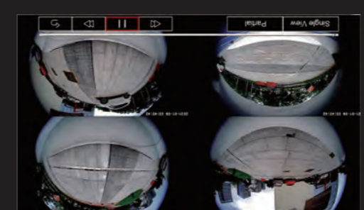
Effective Pixels AHD 1280Hx720V