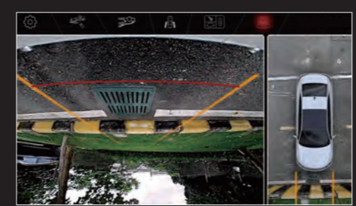
Core Micro De-distortion Technology